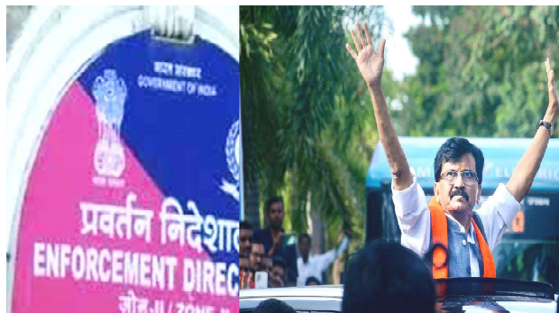
The Shiv Sena MP Sanjay Raut waving to crowd before proceeding to the ED office in South Mumbai.